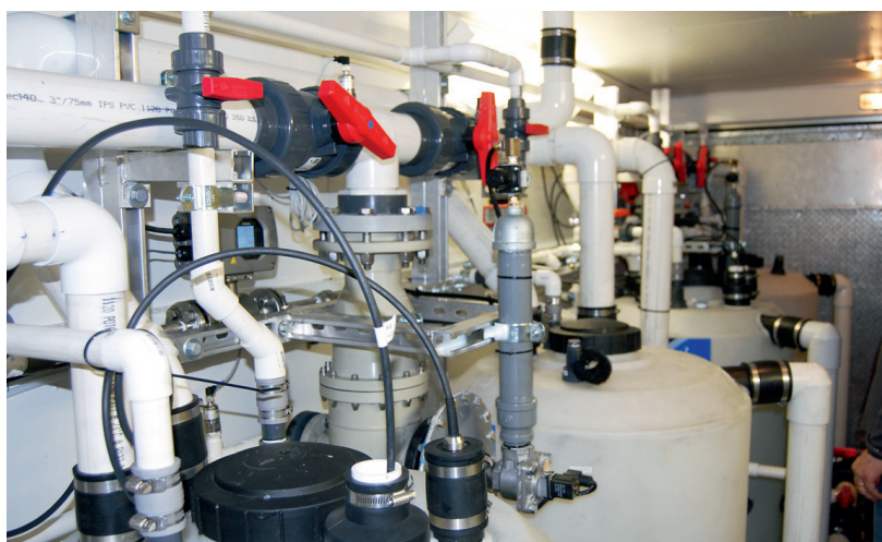
Inside the Quick Wash mobile pilot trailer.

"Both processes transfer the phosphorus from the liquid stream to the solid stream, and a significant percentage of this phosphorus releases into the sidestream (e.g. - centrifuge centrate or belt filter press filtrate) during typical dewatering processes. This phosphorus-laden filtrate is then redirected back to the plant's head works where it re-enters the WWTP process, effectively increasing the phosphorus loading that the plant