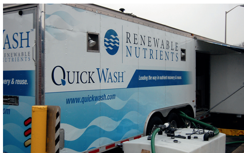
Renewable Nutrients' Quick Wash mobile pilot trailer.